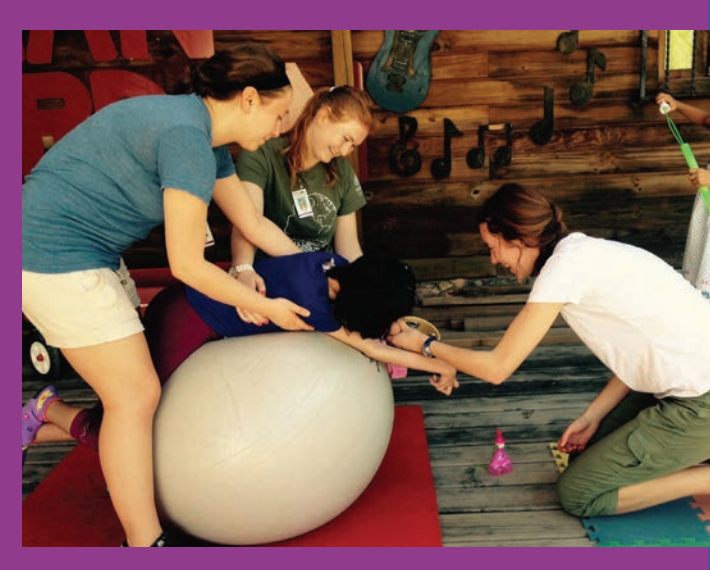
Students conduct a preliminary assessment of a child's motion at an outpatient clinic in the Gualan Nutrition Center during the annual Guatemala Service Learning Trip in March.